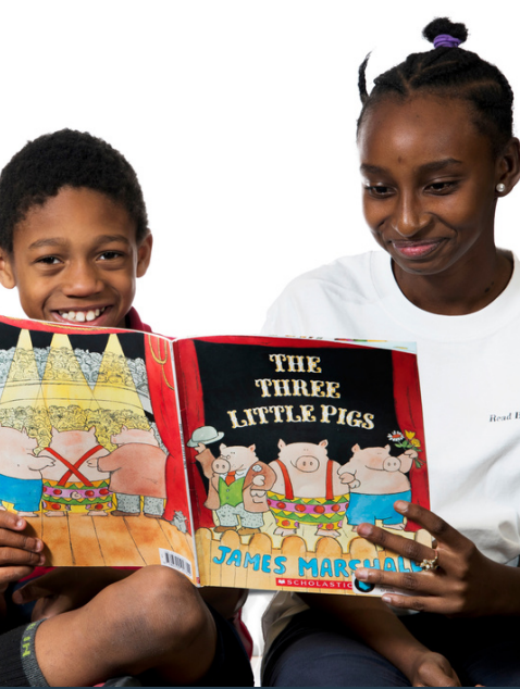
Pictured: A child and volunteer from Read Better Be Better enjoy a book purchased with grant funds from the Literary Society.