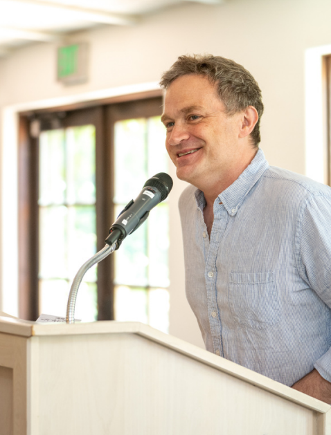
Pictured: Patrick Radden Keefe discusses his books "Empire of Pain" & "Rogues" with Literary Society members