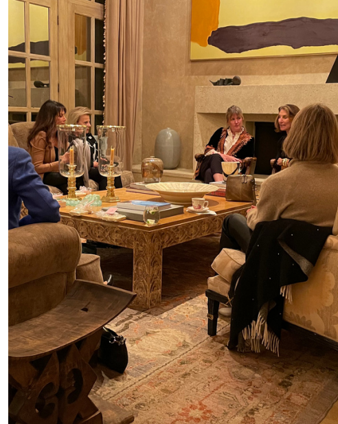
Pictured: Maggie Shipstead at a private author event discussing her books, "You Have a Friend in 10A" & "Great Circle"

Thank you to the 2022/2023 Presenting Contemporary Literature Sponsor